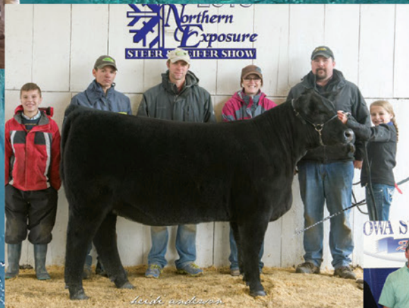
Supreme Breeding Heifer - Northern Exposure