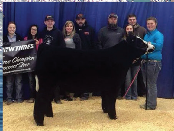
Reserve Champion in one ring & Supreme Champion in B. We have three full sibs to him on sale this year that look great!