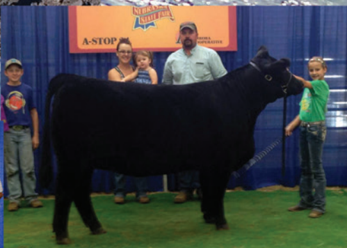
Champion Chi heifer - Nebraska State Fair