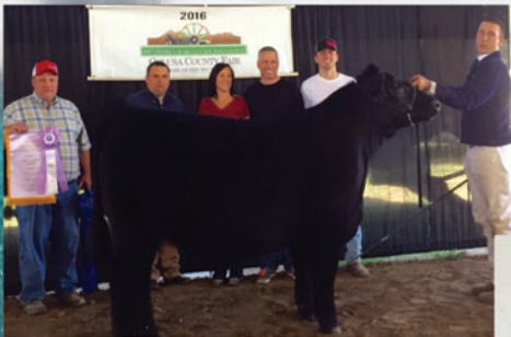
Reserve Champion Steer - Colusa County Fair