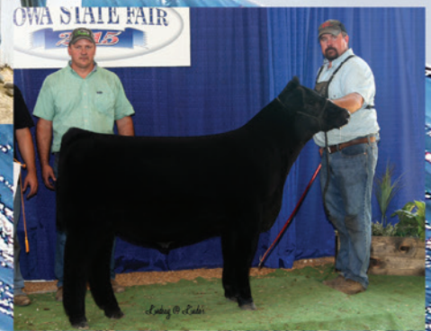
Supreme Champion Feeder Steer - Iowa State Fair