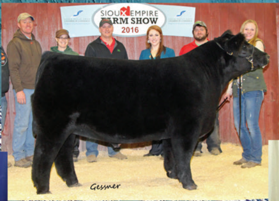
3rd Overall - Sioux Empire