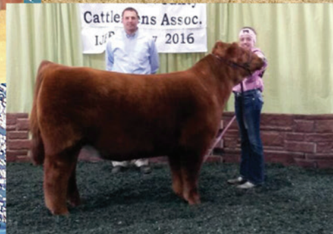
5th Overall Market